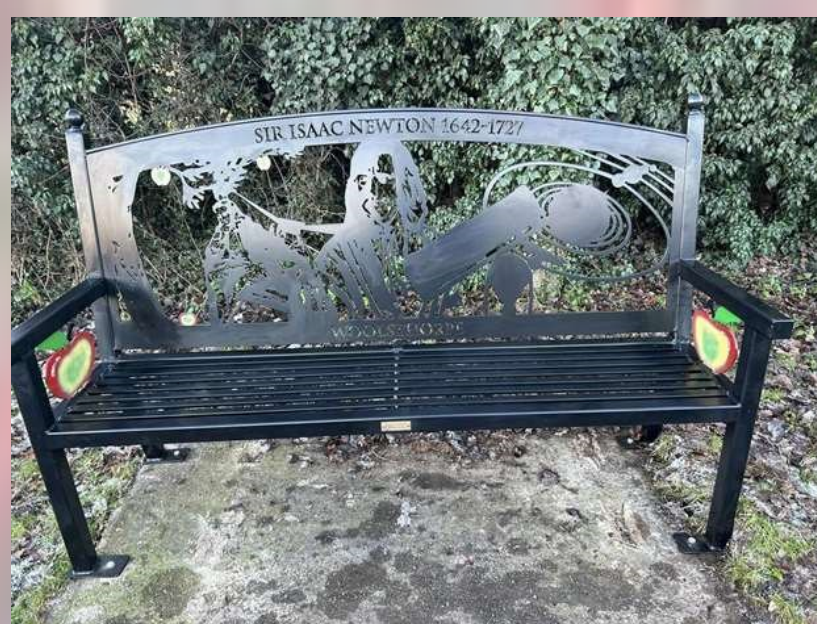
Isaac Newton Commemorative Bench: Woolsthorpe Road

These names are representative of families still living in the Parish including the small village of Woolsthorpe by Colsterworth, notable as the birthplace of Sir Isaac Newton.