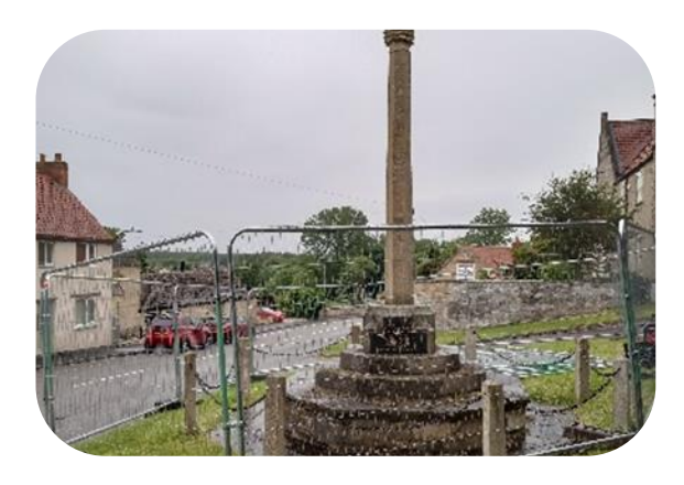
13/06/2024 - Fencing is erected around the War Memorial