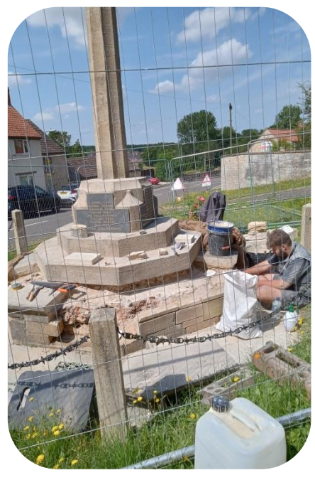
31/07/2024 - Contractor working in the hot sun preparing the area for re-pointing.