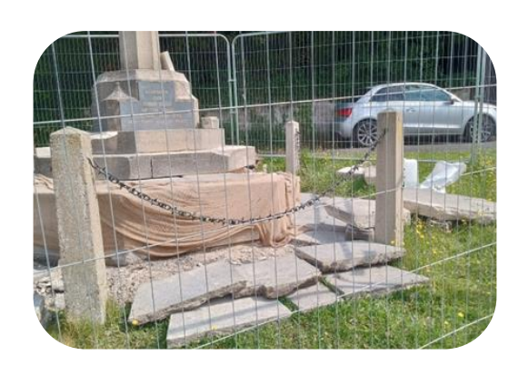
06/08/2024 - Levelling of the ground before replacing the bottom slabs.