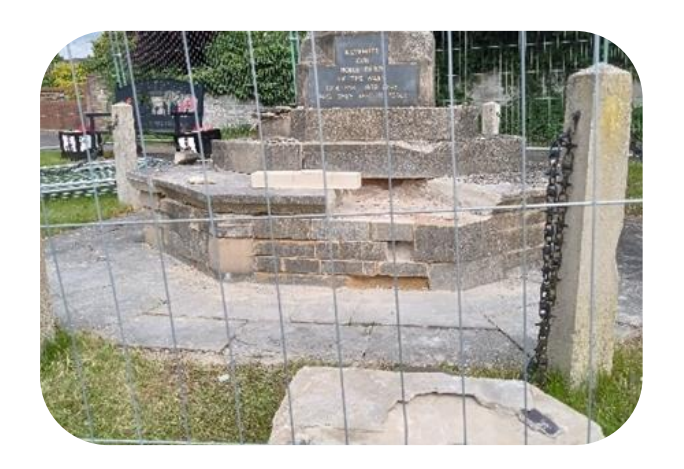
18/06/2024 - The interior of the base is very wet internally which affects the stones. The Architect has agreed that all the slabs to Step 1 will be removed together to allow the structure to dry out.