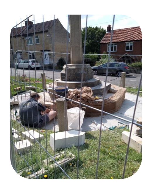
31/07/2024 - Contractor carefully replacing some pointing.