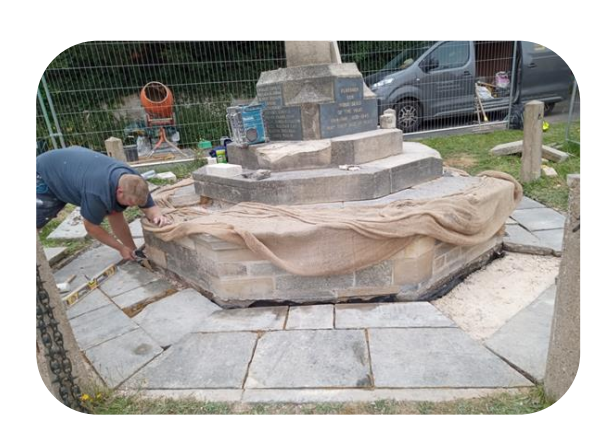
14/08/2024 - Levelling of the ground using a spirit level whilst work continues in the contractors work shop to cut the replacement stones to size.