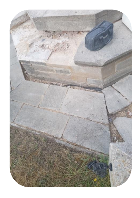
20/08/2024 - The old damaged coping stone has been removed and awaiting the new coping stone to be fitted.