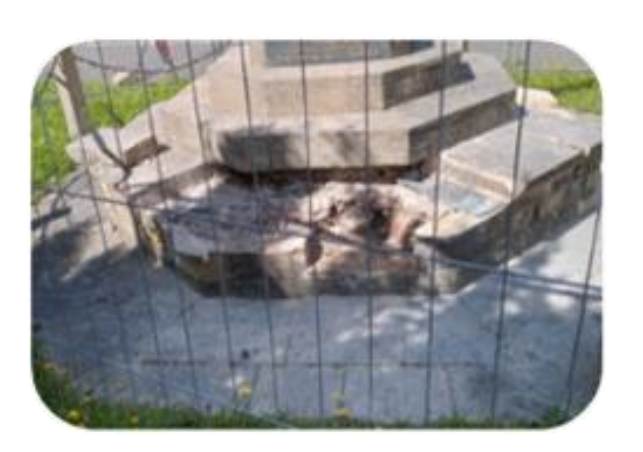
18/07/2024 - The inside of the structure is drying out.