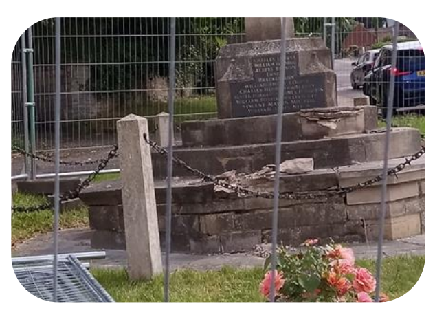
18/06/2024 Deteriation of the slabs can be clearly seen.