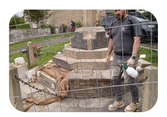
25/07/2024 - Specialist cleaning of the existing stones before the new stones are laid.