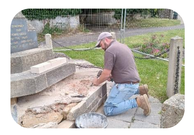
02/07/2024 - A contractor using hand tools to carefully remove stones and concrete from the interior of the base of the War Memorial.