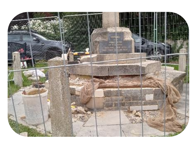
25/07/2024 - Specialist cleaning of the War Memorial from another angle.