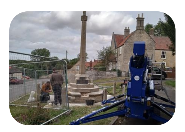
29/08/2024 - A cherry picker is ready to enable the contractors to apply the shelter coating to the top cross.