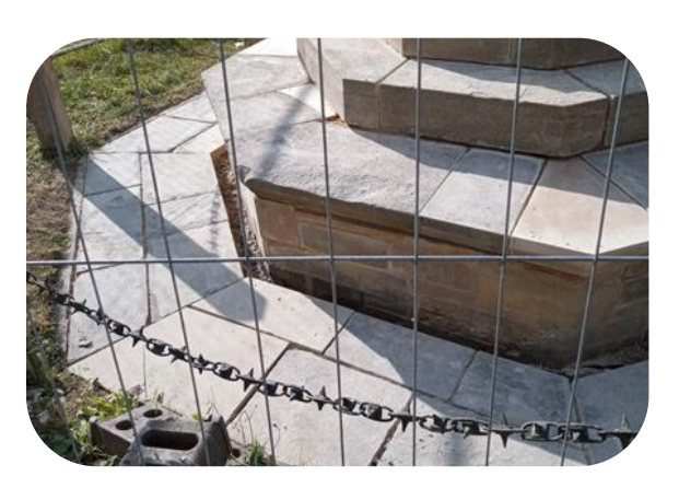
30/08/2024 - The slabs at the base of the War Memorial have been re-set. A small channel has been left between the bottom slabs and the War Memorial for natural drainage.