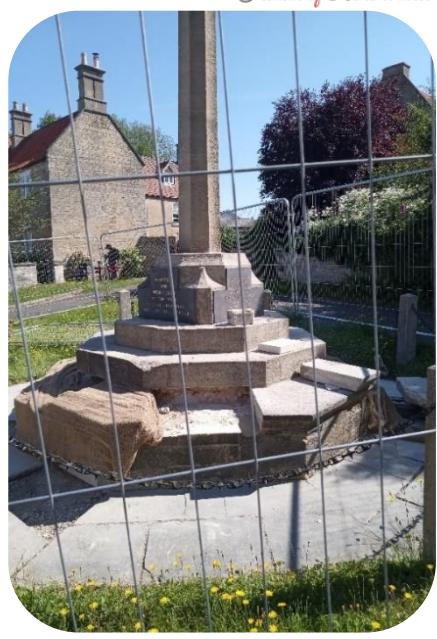
29/07/2024 - Cleaning of the War Memorial is almost complete.