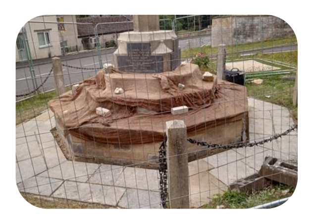
02/09/2024 - Damp weather delays work to finish the restoration of the War Memorial.