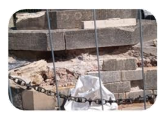
18/07/2024 - Work continues on removing the old pointing and concrete.