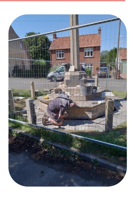
16/08/2024 - New bricks and old bricks being set and