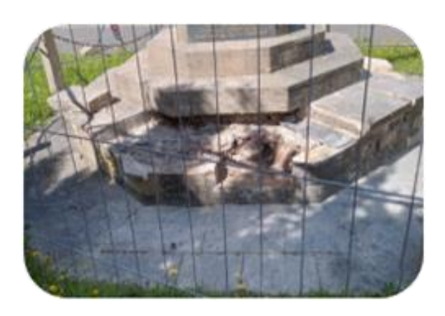
23/07/2024 - The old stones have been cleaned in readiness for the new stones to be put in place.