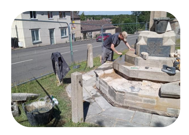
16/08/20245 - Cleaning of the War Memorial continues.