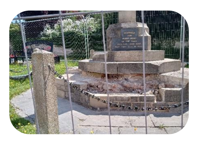
23/07/2024 - The inside of the structure can be clearly seen having dried out.