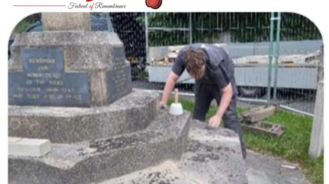
02/07/2024 - A contractor carefully removing old pointing and rubble.