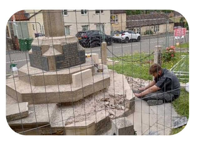
25/07/2024 - A contractor continuing to carefully scraping out old pointing.