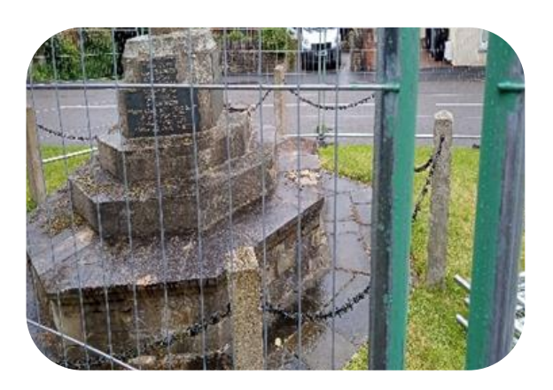
13/06/2024 - Bad weather delays work