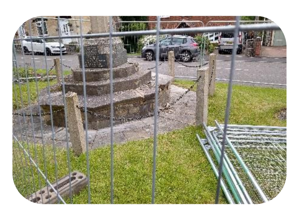
14/06/2024 - The work has to be done by hand tools only.