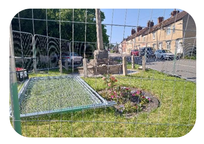
21/06/2024 - The weather has improved allowing the structure to dry out.