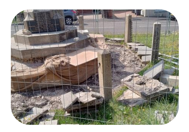
12/08/2024 - Prepartion for replacing the bottom slabs.