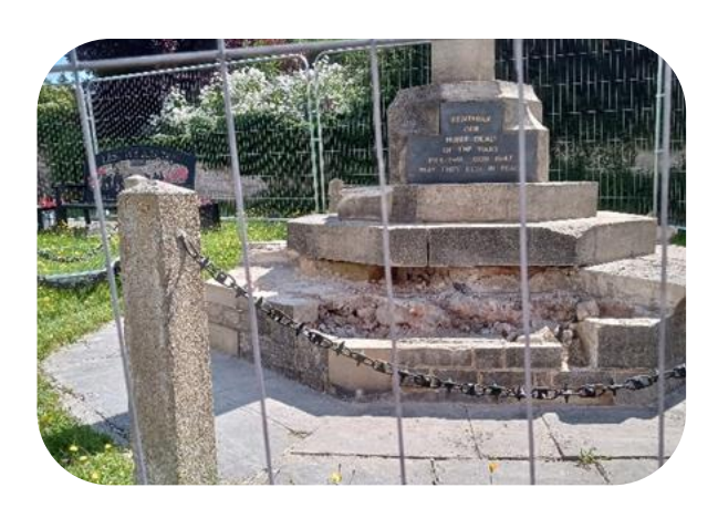
23/07/2024 - The loose mortar and old stones have been removed.