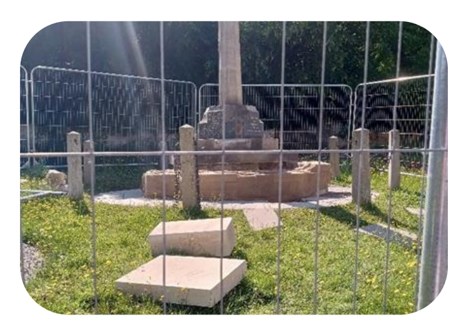
29/07/2024 - New stones are laid on the grass ready for carefully being placed onto the War Memorial.