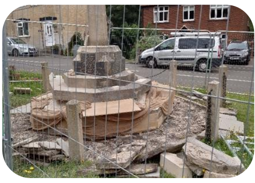
05/08/2024 - The bottom slabs have been removed so the ground can be levelled before they are replaced.