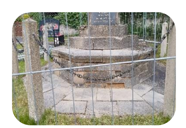
14/06/2024 - Work starts on scraping out the old mortar.