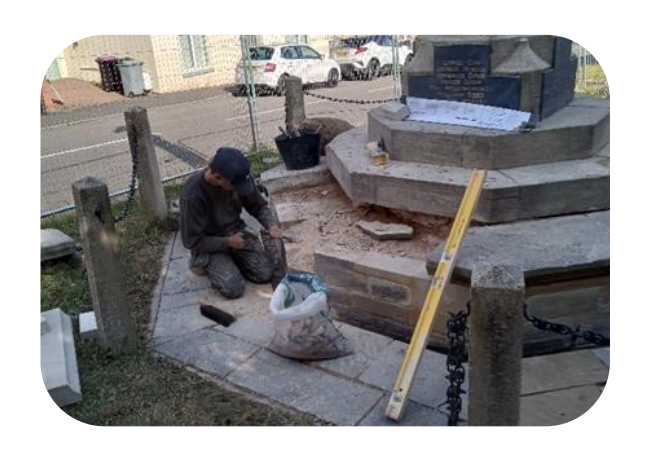
23/08/2024 - Work continues to replace the coping stones. The restoration work is intricate using geometric principles.