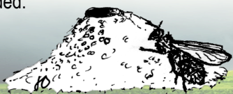
TAWNY MINING BEE

Field margins left for conservation have early annuals like Chickweeds and Speedwells providing nectar and seeds. By first April grassed verges and green lanes were lit by an extravagant display of Dandelions. An early source of nectar for many kinds of Bees, Beetles and flies and a supplier of seeds later in the year, it is a much underrated plant. In our gardens we feel it is in the wrong place (one definition of a 'weed'). On the Roadside Nature Reserve, Woolsthorpe and on the Nature Trail and verges along the A1 the Cowslips are a soft creamy yellow that the Primrose of shadier places earlier provided.