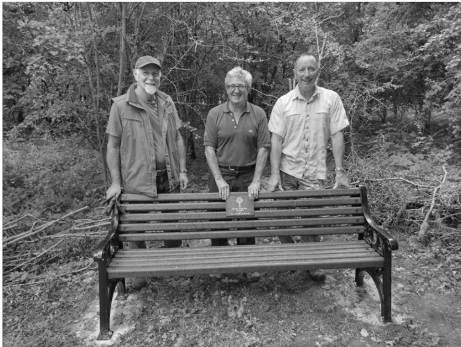
Sited overlooking the Jubilee Wood part of the Queen's Green Canopy tree planting initiative created to mark Her Majesty's Platinum Jubilee in 2022.

Donated by The Colsterworth and District Parish Council