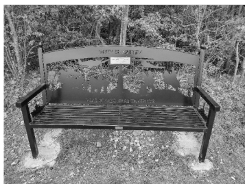
Old Post Lane