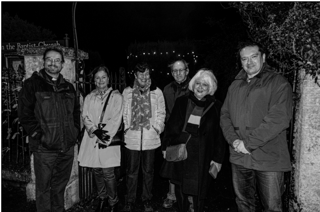
Switching on the Christmas Lights