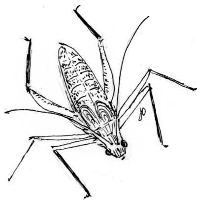
Another photo sent in was of the Speckled Bush Cricket taken at the

The face seemed to resemble a horse (see drawing). Its scientific name is Chorthippus Brunneus , containing the Greek 'hippo' for horse. 'Brunneus' translates as dark, dull brown which it certainly is. One of our most common grasshoppers it is thriving in short, dry grassland. Almost as frequent is the Green Grasshopper which prefers more lush grassland.