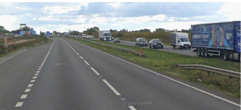
Photo of gap 55 to be partially closed (taken from southbound carriageway)