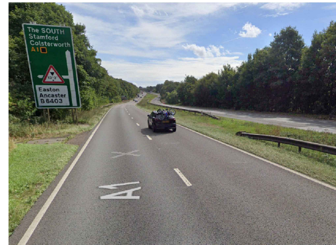
Photo of gap to be 46 to be closed (photo taken from southbound carriageway)