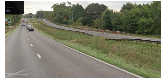
Photo of gap to be 47 to be closed (photo taken from southbound carriageway)