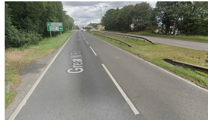
Photo of gap to be 30 to be closed (photo taken from northbound carriageway)