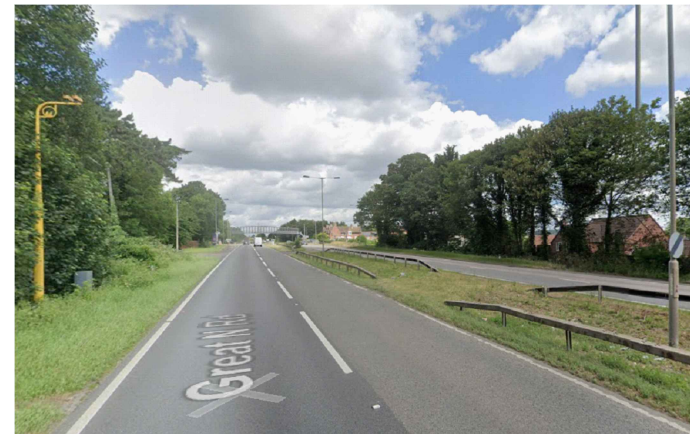
Photo of gap to be 29 to be closed (photo taken from northbound carriageway)