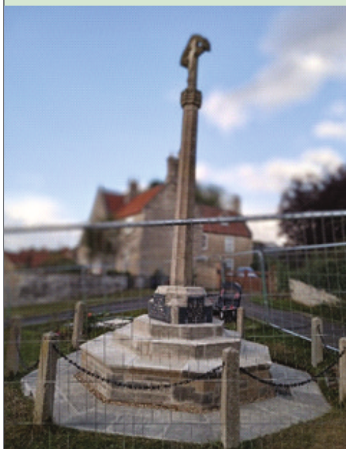
(Photo taken 12/09/2024 for the 'In Touch' print deadline. Temporary fencing to be removed)